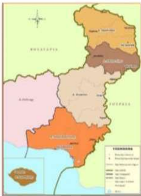
Fig. 1 The Regional Unit of Evros with its respective municipalities

The municipality of Orestiada, along with the municipalities of Didymoteicho, Soufli, Alexandroupoli and Samothraki constitute the Regional Unit of Evros.