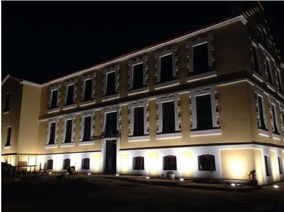
Figure 12. Municipal library of Alexandroupolis, a renovated old tobacco warehouse