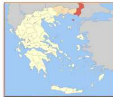
Fig.2 The Regional Unit of Evros and its bordering area

Evros is a borderland area, neighbouring to the North and Northwest with Bulgaria and to the East with Turkey, whereas across its south littoral spreads the Sea of Thrace (part of the North Aegean Sea) and to the southwest lies the Regional Unit of Rhodope. The Regional Unit of Evros covers an area of 4,242 m 2 , and has a population of 147,530 inhabitants, according to the census of 2011. Its capital is Alexandroupolis.