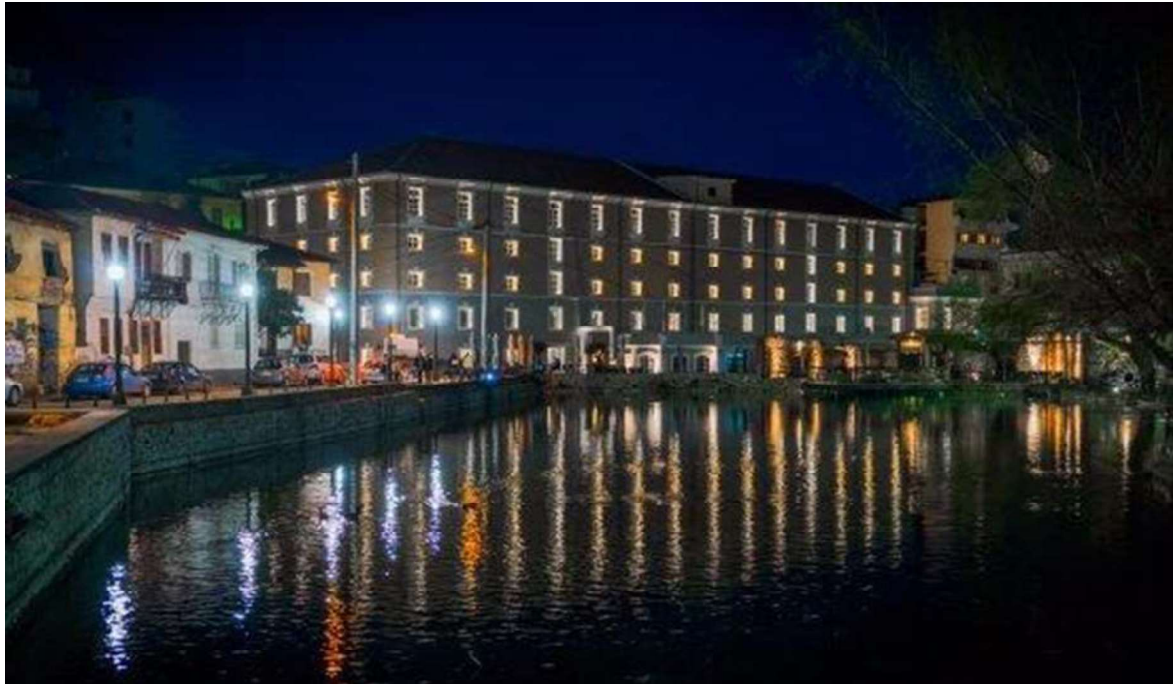
Figure 11. Hydrama Grand Hotel, a renovated old tobacco warehouse

Municipal Library of Alexandroupolis also includes new wooden framed, double-glazed windows. The renovation of building included also installation of natural gas boilers for heating, which will be installed upon the availability of natural gas in Alexandroupolis.